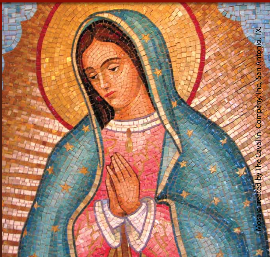
Mosaic created by The Cavallini Company, Inc., San Antonio, TX